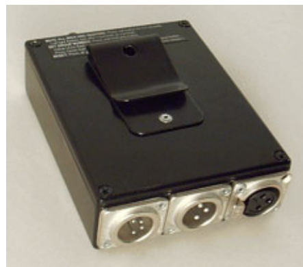
Substation's belt clip and connectors.

The substation will also respond to Clearcom's mic kill where the power supply is interrupted for 100mS.